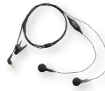
• Hands free headset (earbud)