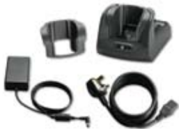
• Single Slot Serial/USB charging cradle with a bay for spare battery charging.